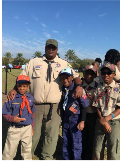
Veterans Day Parade