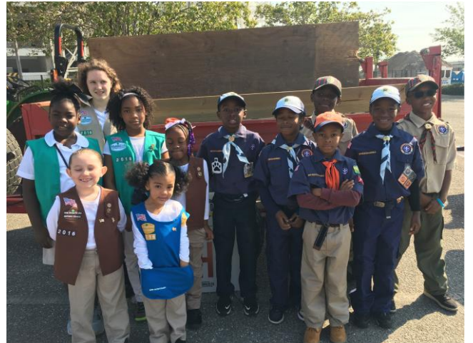
Veterans Day Parade