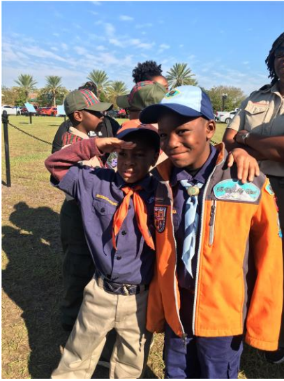
Veterans Day Parade